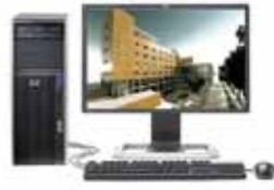
AutoCAD, AutoCAD Architectural