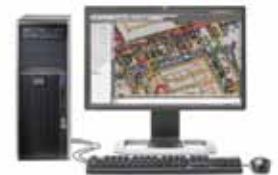
AutoCAD and AutoCAD Mechanical