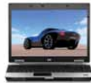
Mobility (for all Autodesk applications)