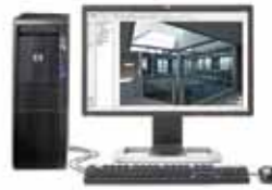
Autodesk Revit Architecture, Structure, MEP