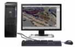
Autodesk Alias, Autodesk Showcase, Autodesk 3ds Max