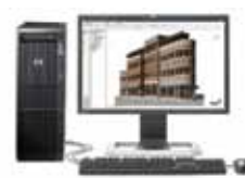
AutoCAD Civil 3D AutoCAD Map 3D