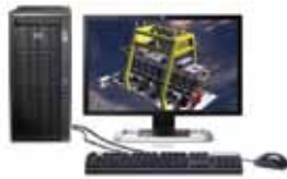
Autodesk Inventor (power user)